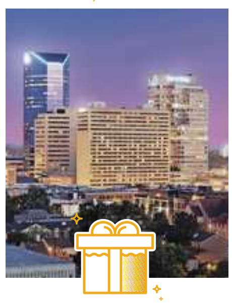
The community rallied together to support a school build in Ghana last holiday season.