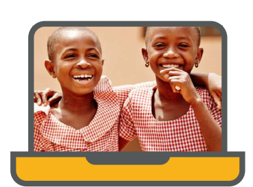
FACEBOOK COVER PHOTOS