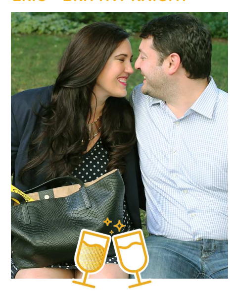
Requested donations in place of wedding gifts to educate children around the world.