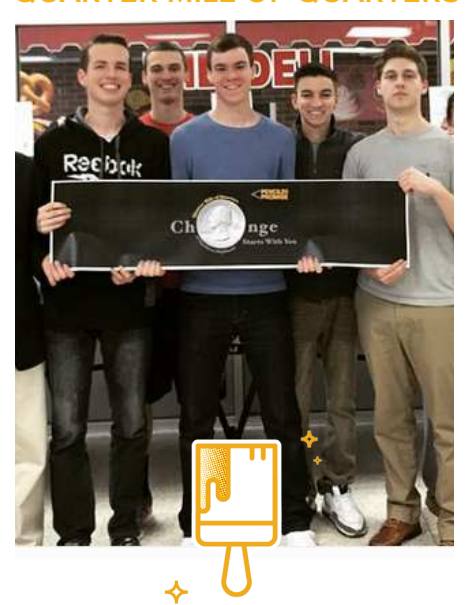
Raised $5,923 in all quarters to support Pencils of Promise's mission around the world.